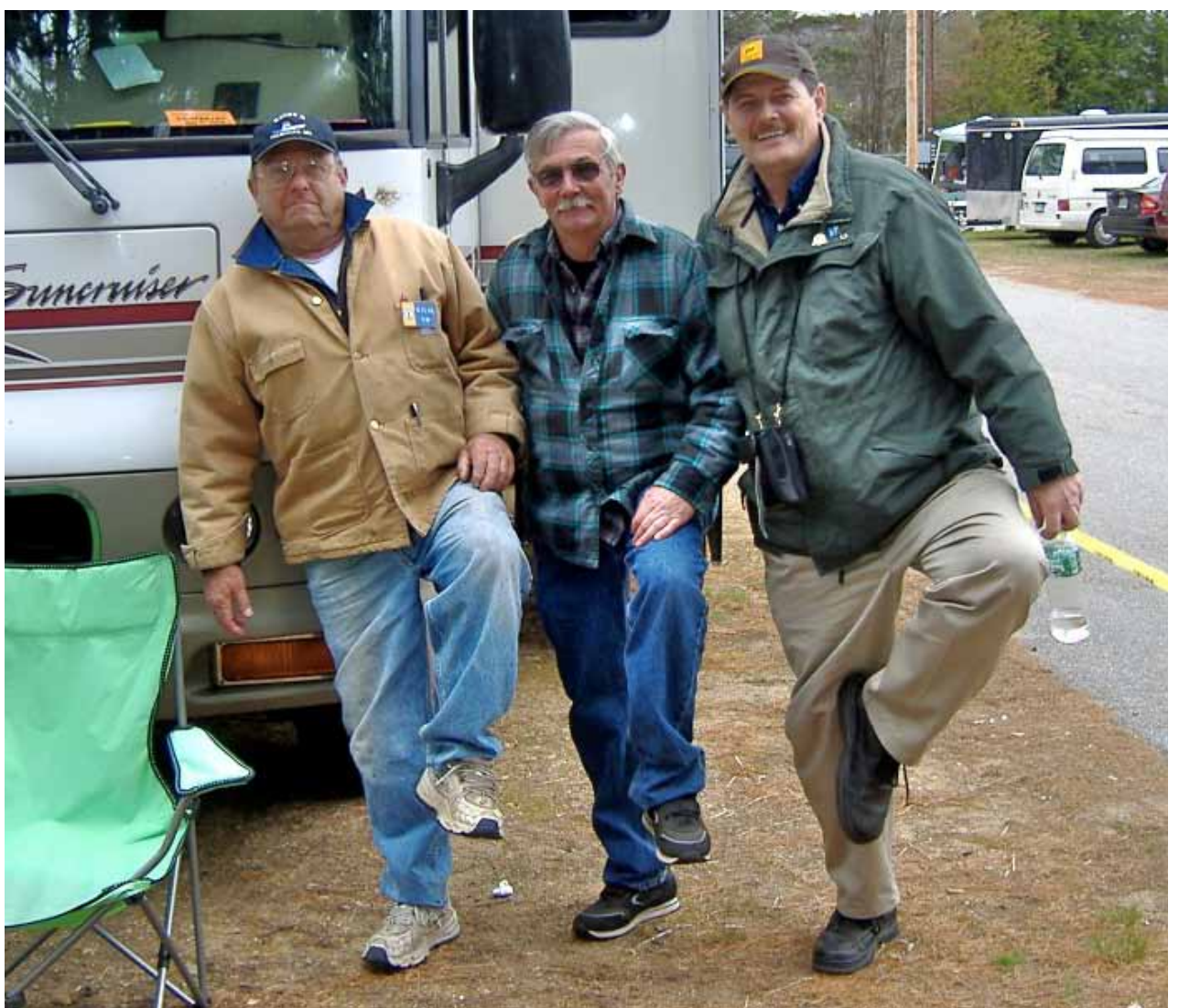
Captain Morgan would be proud!

So look back and remember. We make new memories with every press of the key. We're hams.